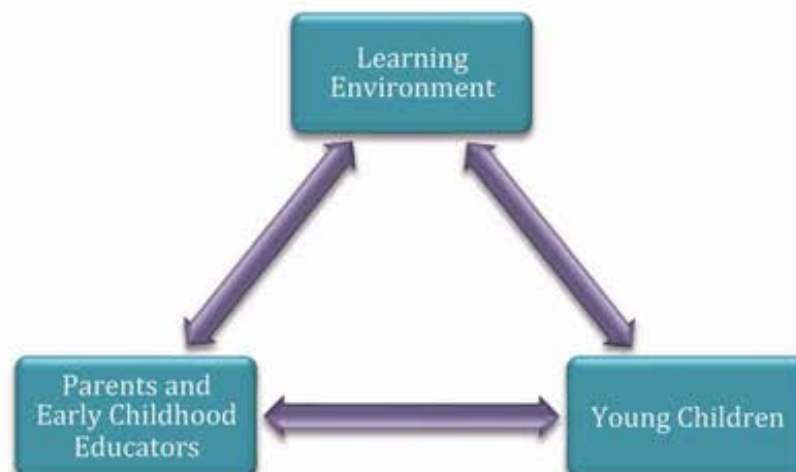
Figure 3: The Early Years Environment

Figure 3: The Early Years Environment integrates the Reggio Emilia and Montessori visions of environment, and describes the communication between the learning environment, early childhood educators and parents, and young children. When children have the opportunity to experiment and make choices on their environments, ECEs have the opportunity to observe children, note their interests and activity choices, and study their experimentations. ECEs learn from these observations as they assess and make meaning of children's strengths, attitudes, and abilities. Parents are part of the process as they share their knowledge of their children with the educators, and participate in rich communication about their children's activities within the Early Years Centre. With this information, ECEs are able to design, adapt, and modify the learning environment so that it is responsive, inviting, and intriguing for the children, and builds on (scaffolds) children's learning.