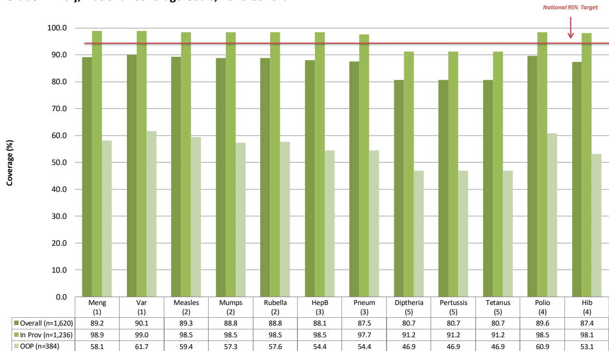
Immunization Coverage by Antigen and Residency Prior to Grade 1 Entry, National Coverage Goals, 2016 Cohort

Based on the national vaccination coverage goals, immunization coverage prior to Grade 1 entry for the 2016 cohort is shown by antigen below. Coverage overall ranged from 80.7% (5 doses of diphtheria, pertussis or tetanus) to 90.1% (1 dose of varicella). Immunization coverage fell below the national target of 95% for all antigens.