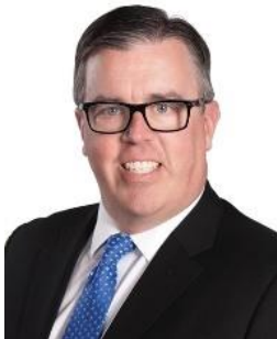
Steven Myers Minister of Environment, Energy, and Climate Action