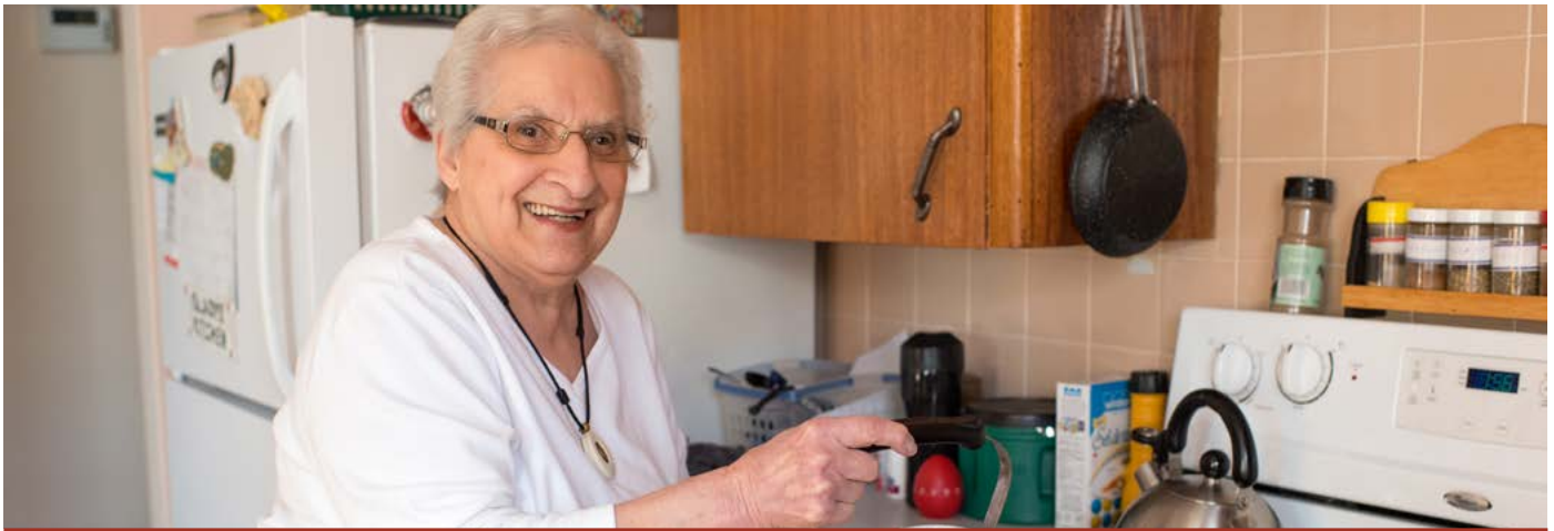
2018-2019 goal is the creation of 275 affordable housing units.

short-term tourist rental market. Websites for short-term rentals make it increasingly easy for owners to advertise their unit to the world.