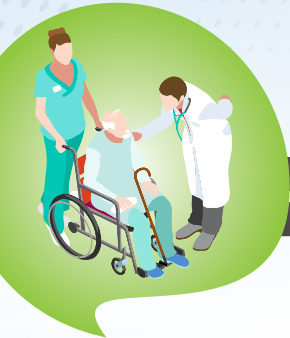
Admission to hospital.